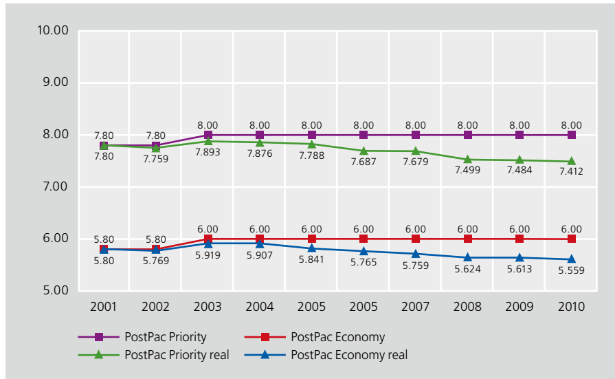
Chart 2: Price History Parcels 2001–2010 (in CHF)

services are more expensive but still within range of Swiss prices. The prices in the other countries in the comparison are much higher. Prices for mailing parcels in Scandinavia are particularly high.